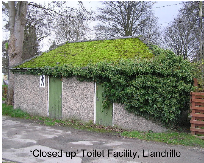
‘Closed up’ Toilet Facility, Llandrillo

Endeavouring keep the doors open thereafter LCC attempted to operate the facility but was beaten by the burden of the annual National Non-Domestic Rate bill, some £500, rendering the effort unsustainable after a few months. Unfortunately nobody told those who needed the facility and when you have to go you have to go, consequently a public health problem was becoming an issue in the immediate vicinity of the closed facility.